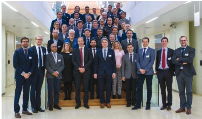
CISE stakeholder group