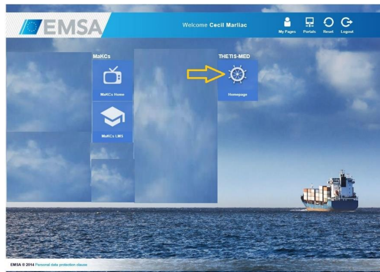
EMSA portal screenshot

Training platform is reachable via internet from URL: https://portal-training.emsa.europa.eu/login.html