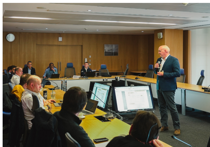
Delegates from across the EU, Canada, and the UK, gathered in EMSA's headquarters for an intensive training session on a variety of Port State Control topics