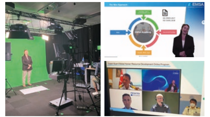
The Coast Guard Global Summit offers the possibility of addressing maritime challenges on a global basis

the full toolbox already developed and on offer to the Agency s stakeholders. The seminar involved all the members of the Coast Guard Global Summit and was followed online by a large number of observers all over the world.