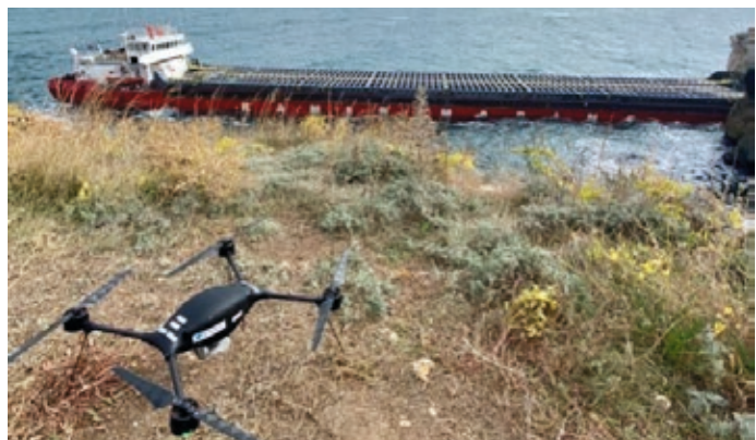
EMSA provided operational support to Bulgarian authorities following the Vera Su grounding in 2021.