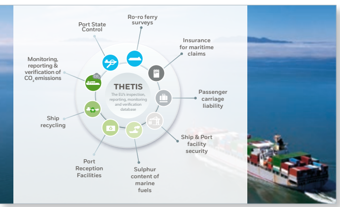
Sample visual showing the THETIS system which continues to evolve as the EU's inspection, reporting, monitoring and

The EMSA Facts & Figures report can now be downloaded from the Agency's website offering interested parties a highly readable and visual overview of EMSA's activities in 2021, the second full year of implementation of the EMSA 5-year strategy (2020-2024). The report is structured around the Agency's five strategic areas of action - sustainability, safety, security, simplification and surveillance, and its four-fold role as service provider, reliable partner, international reference and knowledge hub. The purpose of the report is to share how the Agency is delivering on the aims and ambitions set out in the Single Programming Document 2021-2023 as agreed on by the EMSA Administrative Board and its members who represent the European Commission, each Member State (including Iceland and Norway), as well as industry.