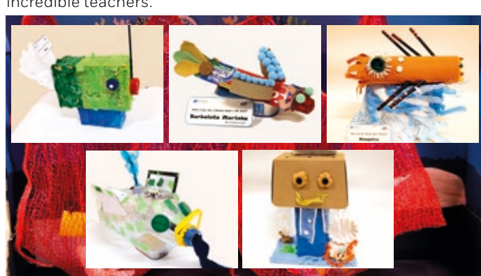
A selection of the winning entries from a whole series of fantastically colourful, creative and thoughtful submissions