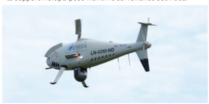
EMSA RPAS are equipped with special gas sensors which can measure the amount of SOx and NOx emitted in the plume of a ship and in doing so indicate possible cases of non-compliance for follow-up by port authorities

The sulphur content of marine fuel in these SECA should be no greater than 0.1%. For any vessel with a measurement above the threshold, EU port authorities will be targeting the vessel for inspection in the next EU port of call following an automatic alert from the RPAS and displayed in the THETIS EU interface system. This year, the special sensors on board the RPAS will also be used in France to check the NOx content emitted by ships in accordance with the new regulations in force in France. Since 1 January 2021, the Channel-North Sea maritime area has been an emission control zone for nitrogen oxides. In both countries, the RPAS will also be used - as a secondary objective - to support multipurpose maritime surveillance activities.