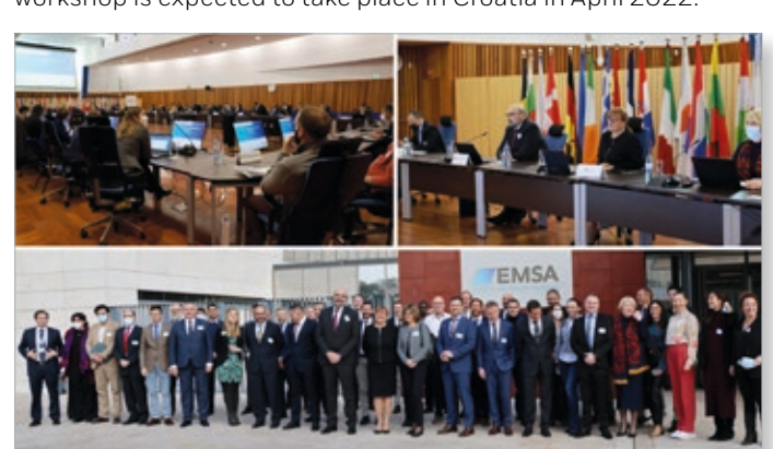
Workshop participants highlighted 'real time exchange of information with shore' as one of the key strengths of using RPAS for maritime surveillance

EMSA hosted the European Coast Guard Functions Forum Workshop on the use of RPAS in Maritime Surveillance, held under the Presidency of Croatia, on 15-16 February. The workshop gathered 150 representatives – both virtually and in person - from 23 coastal states, four EU agencies (EASA, EFCA, FRONTEX, and EMSA) as well as the European Space Agency (ESA), the Maritime Analysis and Operations Centre - Narcotics (MAOC (N)) and the European Commission, DG MOVE and DG HOME. The level of participation reflected the high level of interest in this topic which is of importance to the day-to-day surveillance activities of member state authorities. The workshop provided an opportunity to hear from member states with experience in using RPAS for maritime surveillance purposes, as well as from EU agencies/bodies, and industry. Presentations were given by: Estonia, which is active in regional maritime surveillance activities with Finland and Latvia; France, which is deploying RPAS for emissions monitoring and in doing so supporting port state control authorities; and, Spain, which laid out the various operational scenarios in which RPAS have been used so far. Participants also heard from EMSA on the opportunities presented by the growing portfolio of RPAS services being rolled out. This portfolio is continually being adapted to reflect the newest technologies, focusing on the ones most useful to member state users. The third ECGFF workshop is expected to take place in Croatia in April 2022.