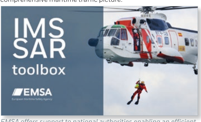
EMSA offers support to national authorities enabling an efficient monitoring of SAR activities.

EMSA recently published a short overview of the Search and Rescue toolbox available to national authorities through the Agency's Integrated Maritime Services. The comprehensive maritime traffic picture provided by the IMS allows for efficient monitoring of SAR activities, marking distress situations and search and rescue assets. When an emergency or incident occurs, national authorities have access to a SAR toolbox which allows them to monitor SAR patterns and mobilised assets using the integrated track functionalities. The toolbox also strengthens preparedness as it gives access to EU maritime authority contacts and early warnings for potentially dangerous situations through the algorithms provided by Automated Behaviour Monitoring alerts. IMS interfaces also link to Earth Observation imageries, products and services to offer a comprehensive maritime traffic picture.