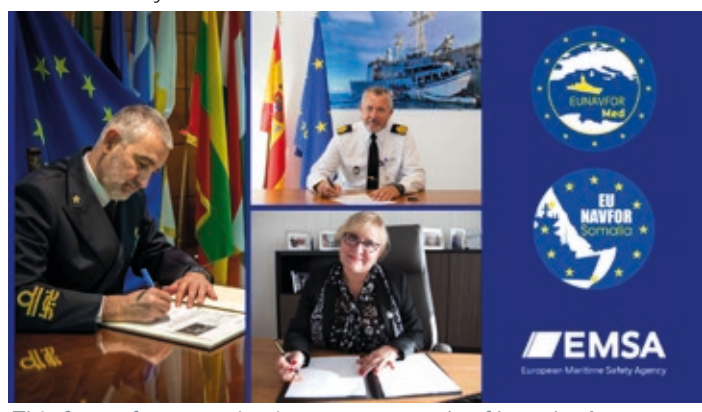
This form of cooperation is a great example of how the Agency is serving maritime security and enforcement communities worldwide.

EMSA is supporting EU Naval Force operations - Atalanta and Irini - following the signature of two cooperation agreements with EU NAVFOR-Somalia (Operation Atalanta) on the one hand and EUNAVFOR MED (Operation Irini) on the other. Operation Atalanta targets counter piracy and the protection of vulnerable vessels and humanitarian shipments off the coast of Somalia, while Operation Irini seeks to enforce the UN arms embargo on Libya and in doing so contribute to the country's peace process. By cooperating with EMSA in the areas of maritime security and surveillance, multiple sources of ship specific information and positional data can be combined to enhance maritime awareness for the EU Naval Force in places of particularly high risk and sensitivity. The support provided by EMSA comes in the context of the EU's Common Security and Defence Policy.