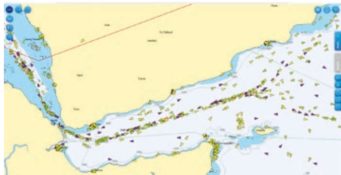
Maritime traffic off the Horn of Africa as displayed on EMSA's Integrated Maritime Services (IMS) platform.