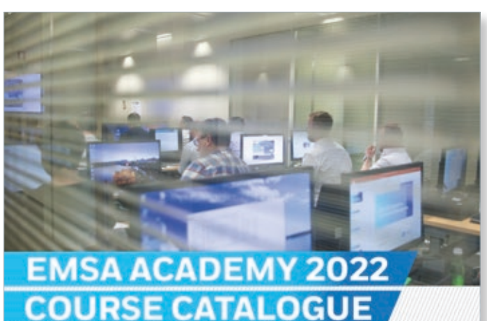
The overall goal of EMSA training is to build capacity at national

EMSA has just published the catalogue of courses offered to national authorities under the framework of the EMSA Academy. This document sets out the various programmes that form the basis of EMSA's routine training activities. It describes those courses which are offered to the national authorities of EU Member States, Norway and Iceland, Enlargement and European Neighbouring Countries, even if these are not necessarily held every year. While the majority of training activities are organised on a regular basis, EMSA also occasionally provides ad hoc courses to cover very specific needs of maritime administrations at a particular time.