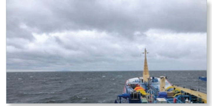
The Norden in action during the exercise in the Gulf of Finland, supporting Member State and Baltic State vessels and activity during the exercise.