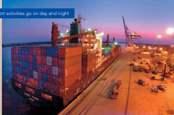
Port activities go on day and night

The countries which register ships, together with their owners and operators, are responsible for ensuring their safety (including the safety of all those on board) and environmental performance. However, not all of them take their responsibilities seriously. Therefore, additional regional inspection regimes have been set in place around the world in order that high levels of control over safety and environmental matters can be applied in these areas. This process is called port state control and operates on the basis that when ships call at ports in different countries, those countries have the right to inspect them to ensure that they are seaworthy. This encourages owners and operators who wish to trade with those countries to ensure that their ships, seafarers, equipment and procedures comply with the relevant requirements.