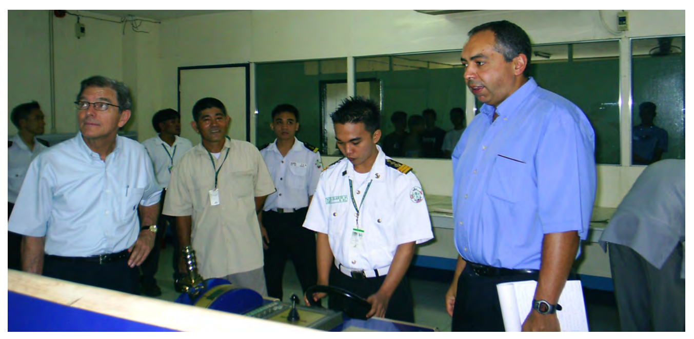
EMSA is currently involved in ensuring that non-European seafarers on board EU ships are trained and certified according to the minimum international requirements as described in the STCW Convention in accordance with Directive 2008/106