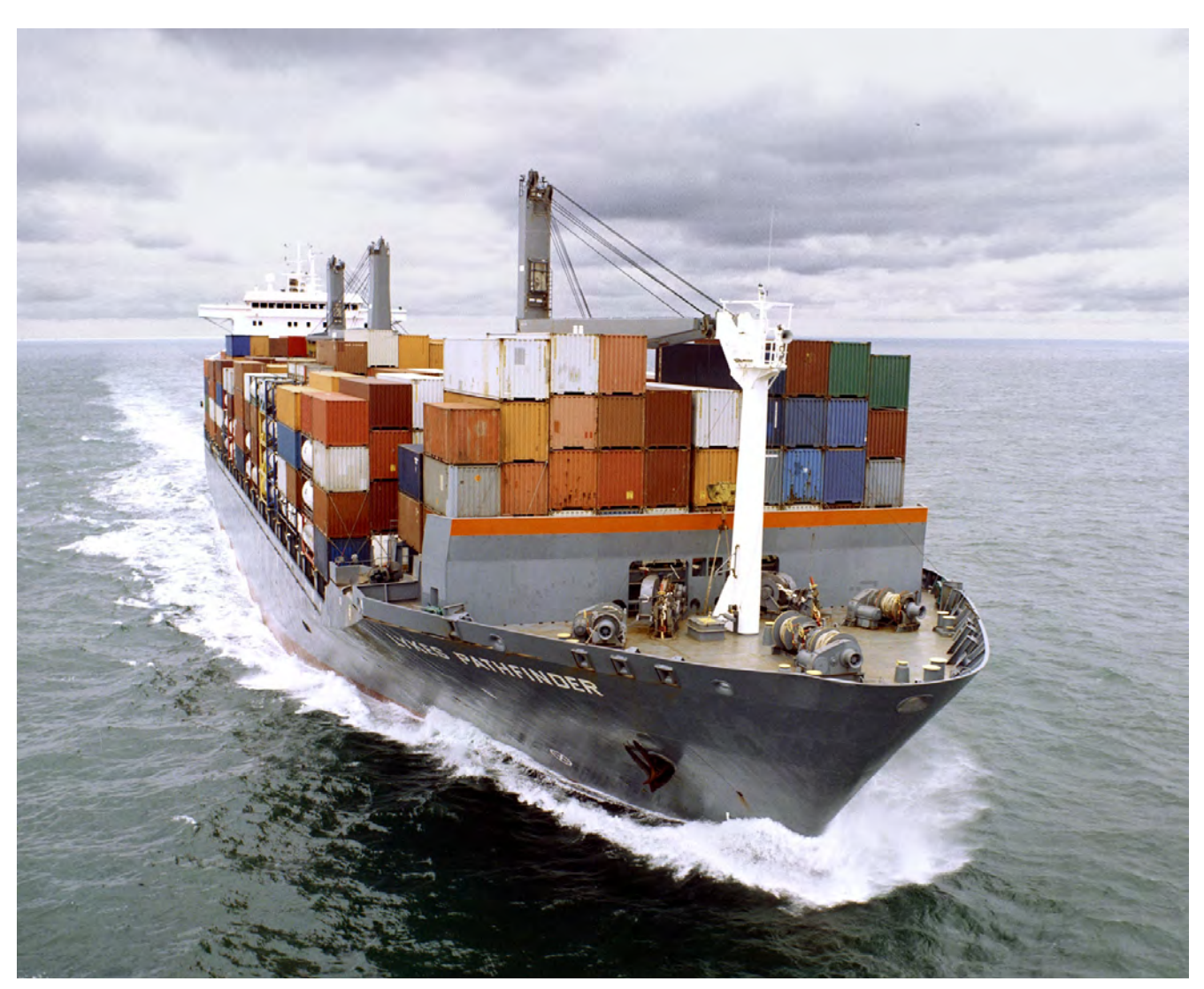
EMSA's SafeSeaNet monitors commercial shipping in EU waters

risk seeing the emergence of sub-standard shipping, as corners are cut in order to reduce costs. Similarly, austerity measures are being introduced by EU Member States which include possible personnel reductions and budget cuts for their Maritime Administrations. This will further strengthen the trends witnessed towards delegating technical tasks to recognised organisations by Member States, which is taken into account in the EMSA strategy.