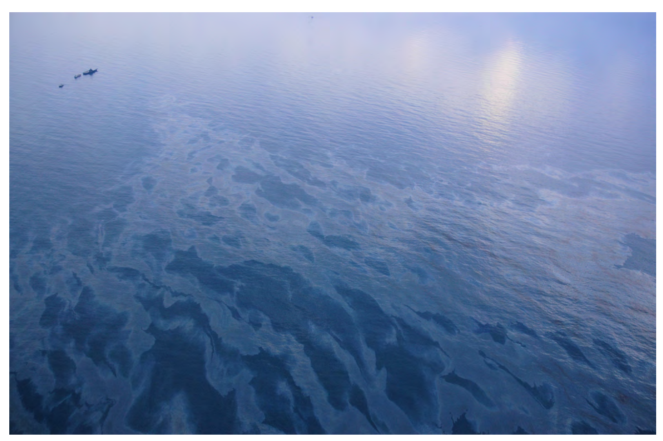
In this photo, a spill from March 2009 when a Russian Aircraft carrier, the Admiral Kuznetsov, polluted waters off the Southern Irish coast

The good performance of CleanSeaNet is unfortunately counterbalanced by the relatively low percentage of enforcement through follow-up actions at national level. In the long run, this may backfire on the service and may put into doubt the added value of delivering such a service at European level, if a large number of polluters remain unchallenged.