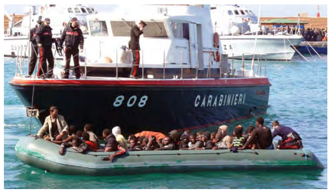
Italian Carabinieri patrol boat intercepts migrant boats. Each year hundreds of migrants trying to reach Europe across the Mediterranean