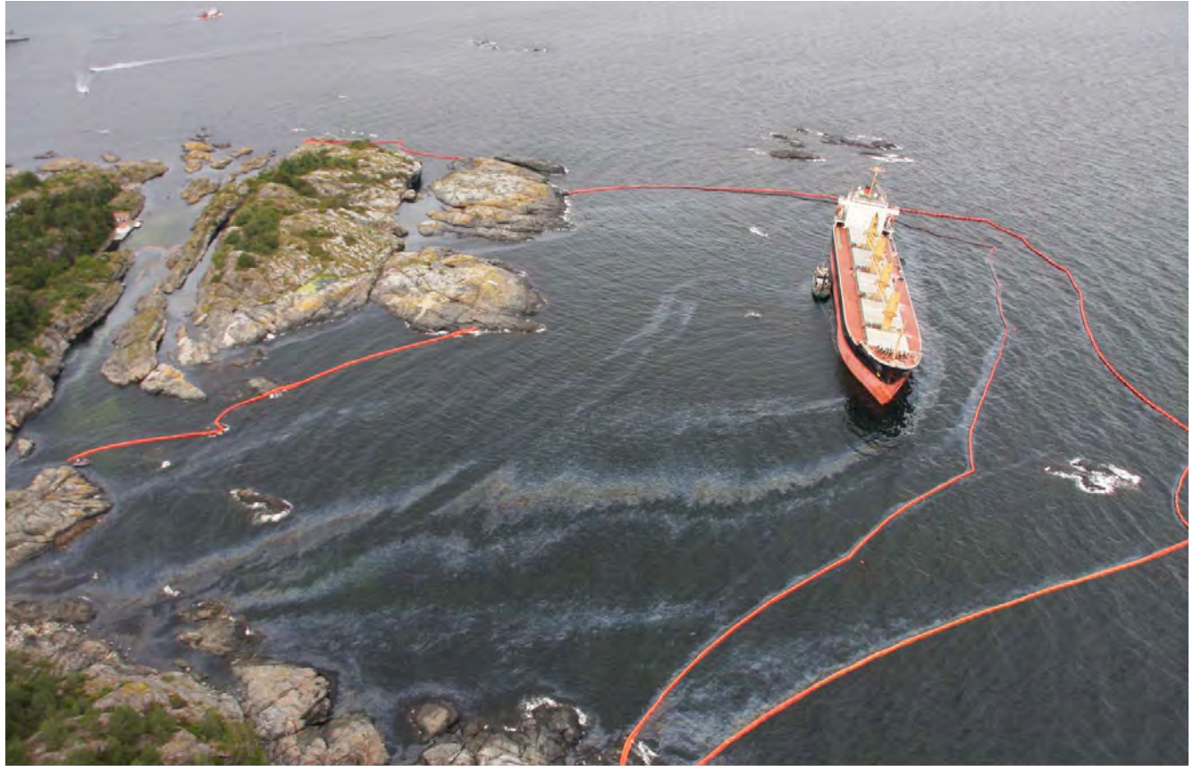
The Full City, aground and spilling oil on the Norwegian Coast