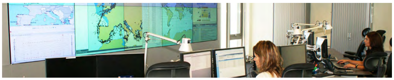
The European Maritime Safety Agency's Maritime Support Services (MSS) centre, operating around the clock

All these will take into account technology that will ensure adaptability in the future to the latest standards such that the systems will be as much as possible based on open source standards, XML and web services, whilst ensuring the highest levels of security.