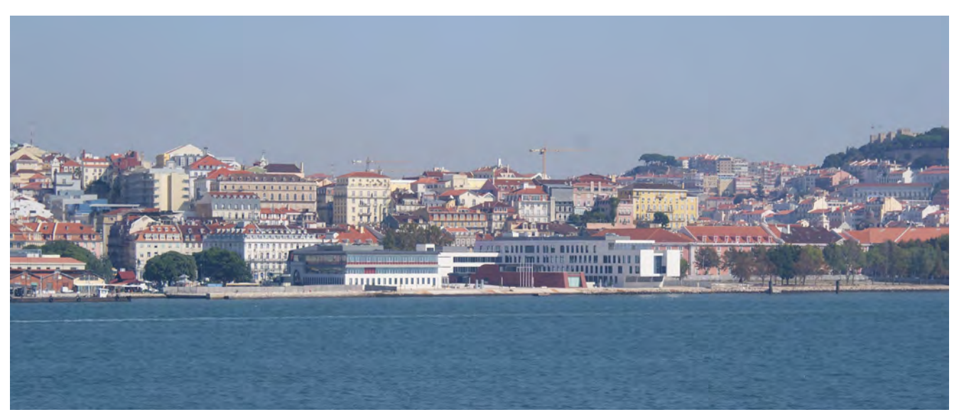
EMSA's headquarters on the river Tagus in central Lisbon