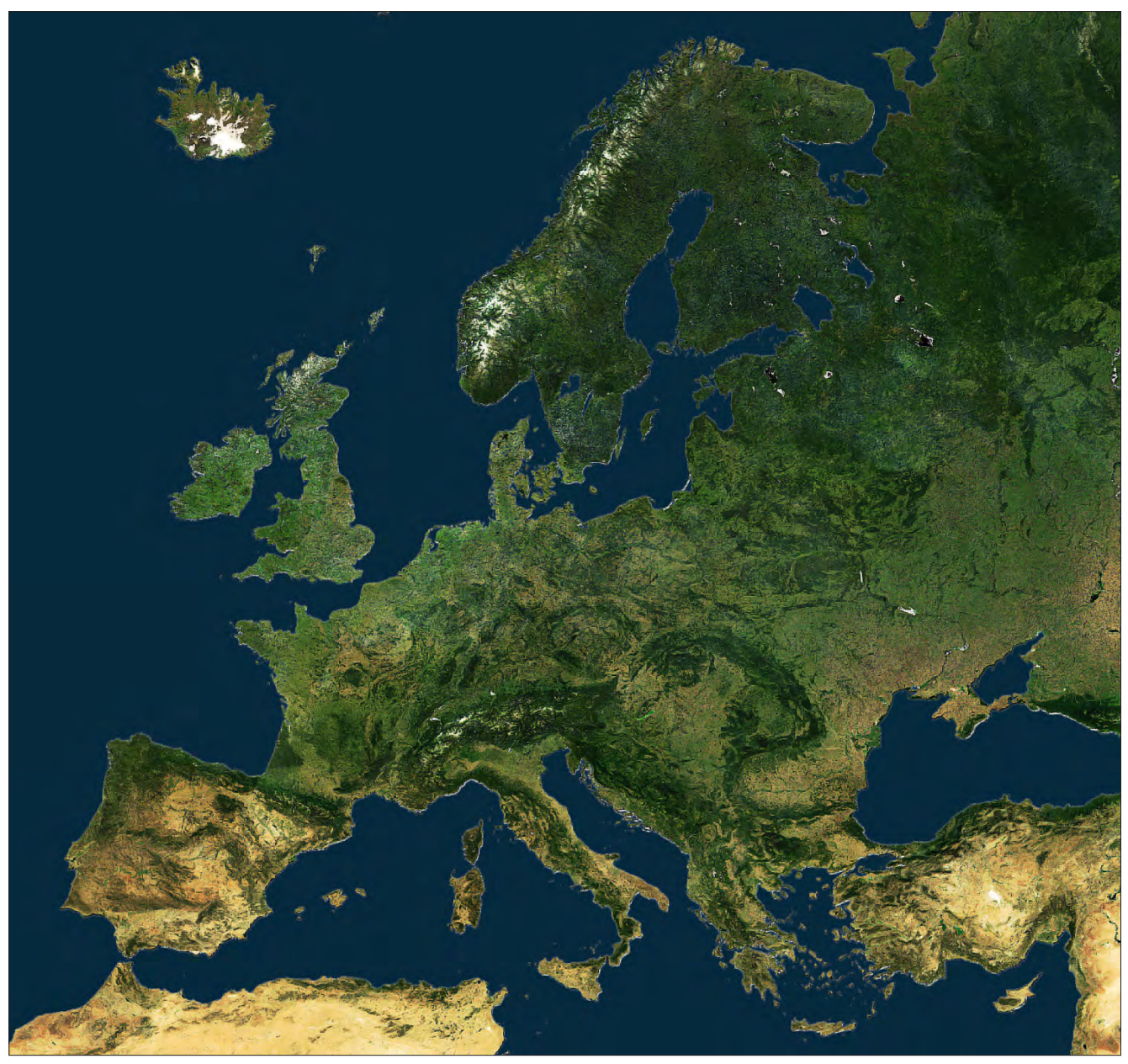
ESA "Earth from Space - United Europe"