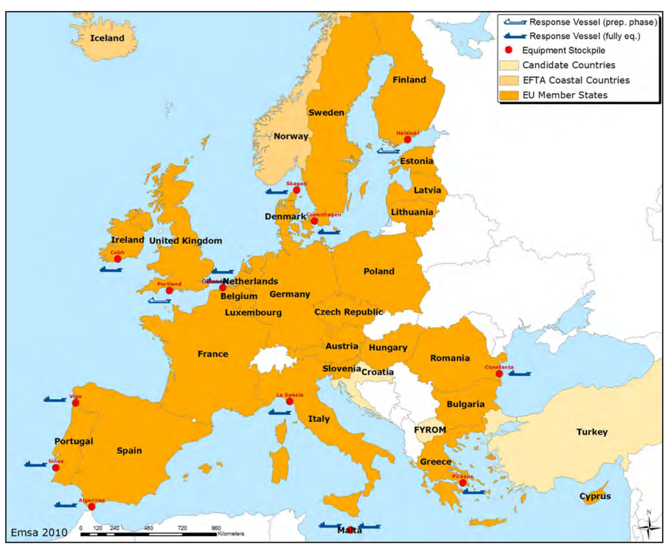
EMSA Vessel map at the end of 2009