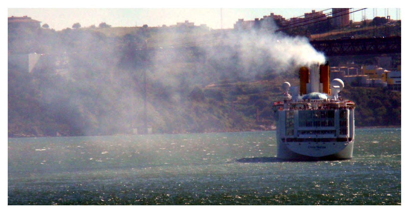
Emissions from ships are considered to be a significant source of air and sea pollution