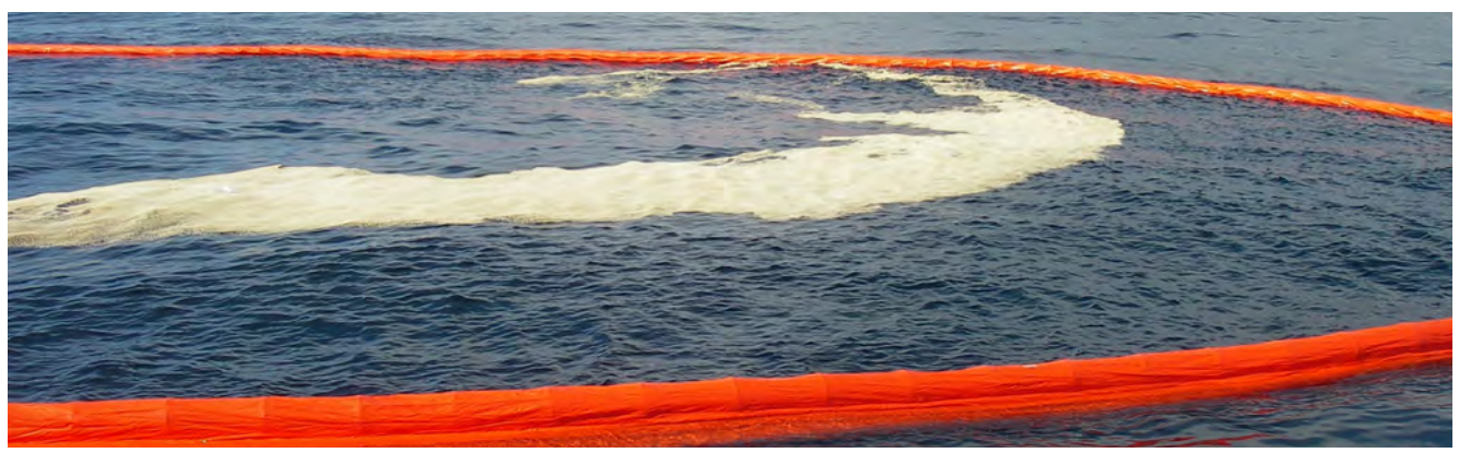
Inflatable oil booms are typically used for offshore oil spill operations

As regards combating the effect of accidental spills of Hazardous and Noxious Substances, the Administrative Board following the adoption of the HNS Action Plan in June 2007, has already implemented the policy line that EMSA should continue to focus on developing a deeper knowledge of "what to do and what not to do" in case of marine chemical incidents. EMSA shall thus serve as a knowledge-centre providing technical assistance to Member States in case of a chemical emergency. The MAR-ICE system is considered a good example of such a tool, developed by EMSA in close cooperation with the European Chemical industry, providing useful assistance to Member States in their operational tasks regarding chemical spills. It is not foreseen for EMSA to develop any direct operational chemical response capacity.