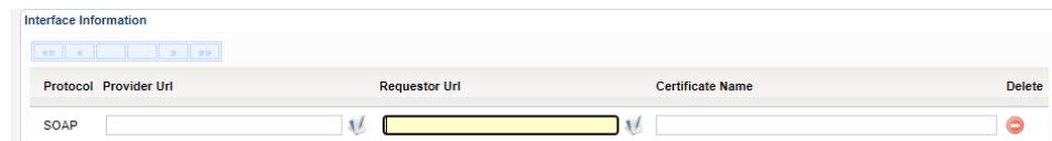
Figure 5 – SOAP/XML interface setup

EMSA shall define the Provider and Requestor URL in SSN Management Console as shown in Figure 5: