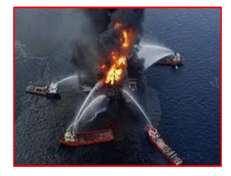
Response to pollution caused by oil and gas installations