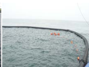
Boom and skimmer