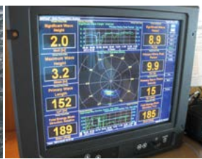
Slick detection system