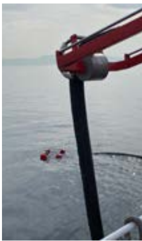
NORMAR 200 Ti