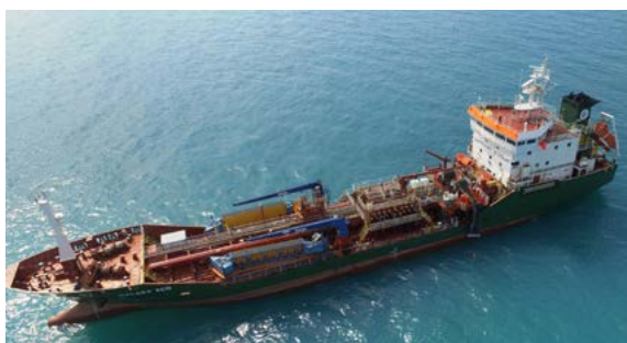
Slick detection system