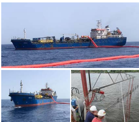
Slick detection system