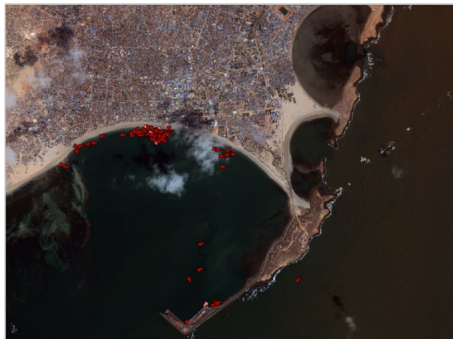
Example of an Earth Observation product delivered through EMSA's IMS portal