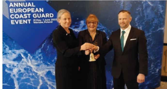
Ring the bell for a change of watch! EMSA takes over watchkeeping duty for coast guard cooperation, steering towards a digital, smart and sustainable maritime domain.

EMSA has taken over the chairmanship of the Tripartite Working Arrangement (TWA) which brings together the European Fisheries Control Agency (EFCA), the European Border and Coast Guard Agency (Frontex) and EMSA to cooperate more closely over the support offered to national authorities carrying out coast guard functions at national, EU and, where appropriate, international level. The handover - from EMSA's sister Agency, Frontex - took place during the fifth Annual European Coast Guard Event on 31 May-1 June in Warsaw, Poland. The event offered the opportunity to look together at three of the specific deliverables being offered to Member States as part of this form of enhanced cooperation: the Maritime Data Catalogue which presents the different datasets available to authorities via the three agencies; the Practical Handbook on European cooperation on coast guard functions and capacity building; and, the Guidelines for the Implementation of Multipurpose Maritime Operations (MMO). Through this enhanced cooperation, the agencies offer support to some 300 authorities working in the coast guard domain providing cooperation solutions through the sharing of information and pooling of resources. This is of particular value in a domain characterised by the multiplicity of authorities dealing with coast guard functions in all shapes and forms.