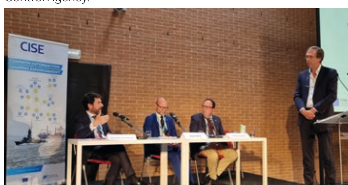
CISE operational use cases demonstrate its value in providing a more complete maritime awareness picture to enable timely and efficient response.

On 19 May, EMSA held a hybrid workshop in Ravenna, Italy dedicated to the Common Information Sharing Environment (CISE) and its practical use in the EU maritime domain. The CISE workshop was organised under the theme of maritime security. A particular focus was placed on the operational use of CISE and its added value to the Member States' maritime surveillance efforts. In the presented operational scenarios, CISE played a key role in gathering additional information helping maritime authorities to obtain a more complete maritime awareness picture and to undertake necessary actions in a timely and efficient manner. Moreover, the role of CISE as an important asset in the maritime security domain was highlighted. The workshop was organised in close cooperation with the European Commission (DG MARE), the Secretary General of the Sea of France and the European Fisheries Control Agency.