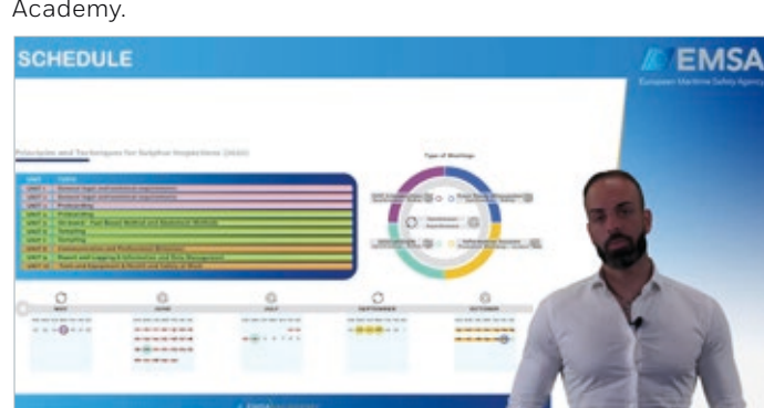
The new curriculum sets out to give Member State authorities greater flexibility over their learning experience with a view to successfully carrying out sulphur inspections on board ships.