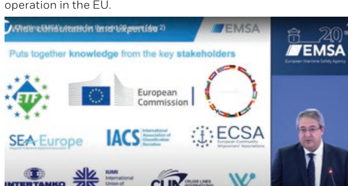
Live streaming of the EMSAFE launch during EMSA's anniversary conference

The first comprehensive overview of maritime safety in the EU has just been released by EMSA, giving a factual overview of a wide range of maritime safety topics, as well as an in-depth analysis of specific technical areas. The European Maritime Safety Report , now commonly referred to as EMSAFE, combines information from all the databases hosted by EMSA to give detailed insights into the status of maritime safety in the EU. The first report of its kind, EMSAFE is the product of task force composed of staff from across the Agency. Valuable input was also provided by several maritime stakeholders including: the European Commission, the Member State Administrations, the European Community Shipowners' Association (ECSA), the International Association of Classification Societies (IACS), the European Transport Workers' Federation (ETF), SEA Europe, INTERTANKO, the Waterborne Technology Platform, the Cruise Lines International Association (CLIA) and the International Union of Marine Insurance (IUMI). The report looks at the development, application and status of relevant EU and international safety standards, with the aim of contributing to a greater understanding of the safety-related challenges and opportunities facing the maritime sector, by bringing together a set of key technical data related to the safety of ships and their operation in the EU.