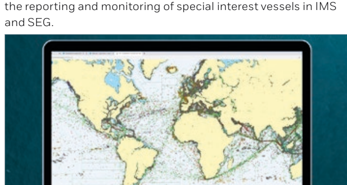
EMSA's Integrated Maritime Services provide a global integrated maritime traffic picture to EU Member State authorities

On 25 May, EU Member State IMS representatives met in person at EMSA and remotely online to discuss service developments and related operational topics. IMS are part of EMSA's Maritime Digital Services and provide a global integrated maritime traffic picture, as well as advanced information services on vessels for maritime safety, security and environmental protection. IMS support national users with tailored functionalities as well as collect, integrate and enable the sharing of maritime data, which is organised in specific operational 'toolboxes'. The IMS user consultation meeting focused on the state of play of IMS, the available graphical (SEG, Mobile App) and web interfaces, cloud-related developments and Automated Behaviour Monitoring (ABM) algorithms. During the meeting, EMSA presented the initial outcome of the study on potential Artificial Intelligence and Machine Learning solutions and the results of the work of the expert group on 'Drift Modelling'. Member State experts evaluated previous actions and put forward scenarios for advanced analytics, the detection of cases of possible spoofing, and learnt more about the reporting and monitoring of special interest vessels in IMS and SEG.