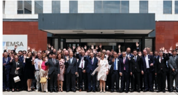
Hip Hip Hooray! All together in wishing EMSA a Happy Birthday!