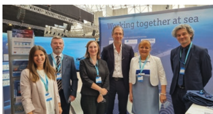
The next EMD event is scheduled to take place in Brest, France, on 24-25 May 2023.