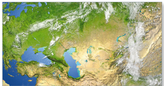
The Black and Caspian Sea project started on 1 February 2017 and runs for 48 months

Within the framework of the SAFEMED IV Project and the Black and Caspian Sea Project, EMSA hosted in April the first meeting of the Secretariat of the Mediterranean Coast Guard Functions Forum (MCGFF) as well as a coordination meeting with the Black Sea MoU Secretariat. The MCGFF meeting was attended by the Turkish Coast Guard, the Italian Coast Guard and the French Sea Administration, as current, past and future chairs of the forum. The event is designed to enhance cooperation between EU and non-EU Mediterranean countries as well as to reduce the gap in the implementation of international maritime conventions. EMSA, EFCA and FRONTEX, the three agencies cooperating on Coast Guard Functions, attended the meeting as observers. The meeting concluded with a road map and list of actions to be taken in view of the plenary session expected in October in Turkey. The coordination meeting between EMSA and the BS MoU Secretariat covered the activities already delivered by the agency under TRACECA II as well as future activities to support the PSC authorities of non-EU members of the BS MoU. The main outcome of the meeting was the agreed proposal for EMSA to implement a professional development scheme for PSCOs.