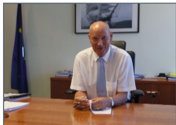
EMSA's Executive Director gives feedback on the board meeting via an internal video

In addition to the usual financial statement and annual report for 2013, EMSA's Administrative Board addressed a number of key points at its meeting on 12-13 June. These included the follow-up to inspections and visits to member states; offering assistance on the sulphur directive to the Commission's Environment Directorate-General; and, providing technical support to three member states on the National Single Window. The Administrative Board also analysed the Agency's work programme for 2015, a discussion that will be continued at its next meeting in November.