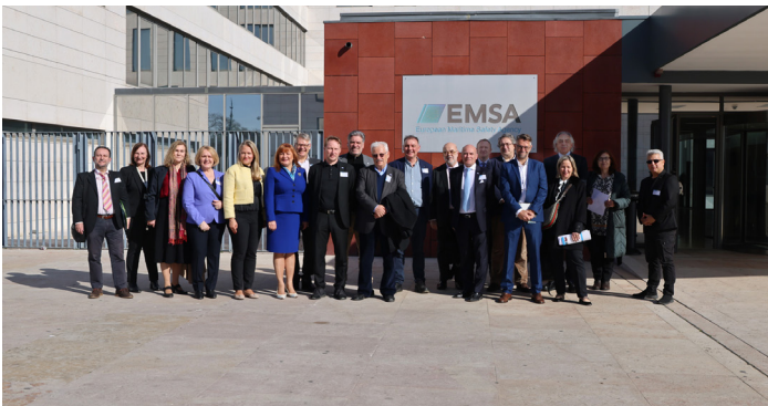
The delegation of members from the European Economic and Social Committee learned more about EMSA's work and mandate during their visit.