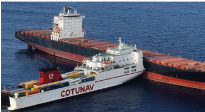
The collision between M/V 'CSL Virginia' and Ro-Ro 'Ulysse' off Cap Corse on 7/10/2018 was subject to a full safety investigation (BEA Mer - France)

Over a ten-year period (from 2011 till 2021), the EU-EEA member states reported in the European Marine Casualty Investigation Platform (EMCIP) 8 800 occurrences involving navigation accidents concerning passenger, cargo and service ships, of which 351 have been investigated. Drawing lessons from this data is the objective of EMSA's latest safety analysis which focuses specifically on the safety investigations involving these types of ship, given their visibility and relevance in the context of maritime safety. Nine safety issues have been identified: work/operation methods carried out onboard the vessels; organisational factors; risk assessment; internal and external environment; individual factors; tools and hardware; competences and skills; emergency response and operation planning. The analysis also considered the remedial actions suggested to prevent similar occurrences from happening in the future, either proposed by an Accident Investigation Body, or autonomously taken by the relevant stakeholders, like the ships' companies and maritime authorities. In addition to the full analysis of the factors contributing to navigation accidents reported in EMCIP, a compact summary report has also been prepared to outline the main takeaways in a very succinct way. A Consultation Group composed of experts from voluntary EU Accident Investigation Bodies provided valuable input into drafting the documents.