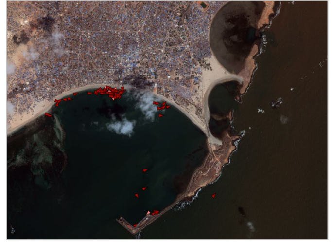
Example of an Earth Observation product delivered through EMSA's IMS portal