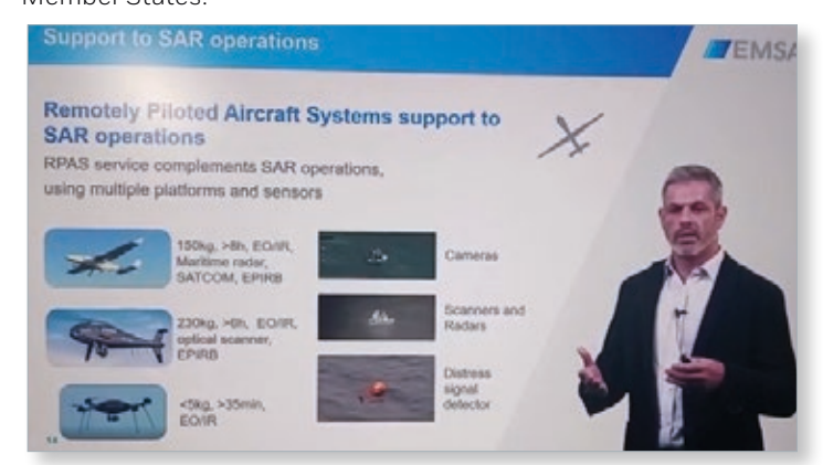
EMSA staff member delivers presentation on the use of RPAS for SAR operations

Within the context of European Coast Guard cooperation, a pilot session on search and rescue (SAR) was held virtually on 9-10 December by EMSA and its sister agencies EFCA and Frontex. The session was geared towards Member State organisations which are not directly involved in SAR activities. The purpose of the session was to raise awareness of the framework governing SAR, introducing the main elements of the IAMSAR manual and providing basic information about the legislative and operational framework regulating SAR activities. The session brought together more than 50 participants from 22 organisations from 16 Member States. Presentations were delivered by the three EU agencies involved, the Finnish Border Guard and the Italian Coast Guard. In addition, EMSA presented the support capabilities that the Agency can provide to the