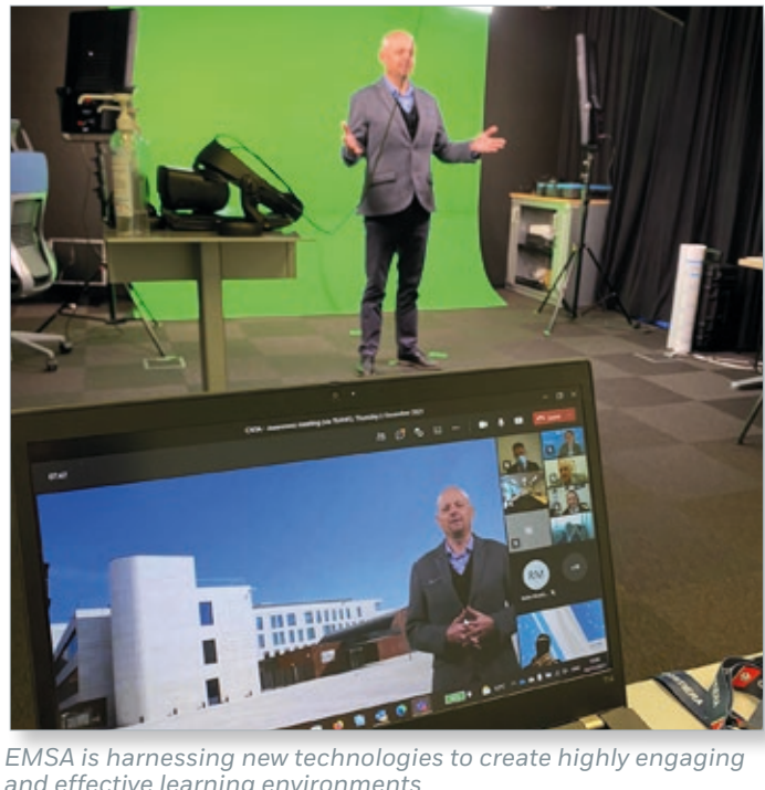
and effective learning environments

On 2 December the Member State representatives making up the Consultative Network on Technical Assistance (CNTA) were invited to an update on the latest developments of the EMSA Academy, a flagship project for the Agency. They were informed on how training needs will be identified and how the EMSA Academy will deliver learning services outside formal education following the provisions of ISO 29993:2017. Virtual presentations were delivered using the new chroma-key technology available in the Agency's eLaboratory.