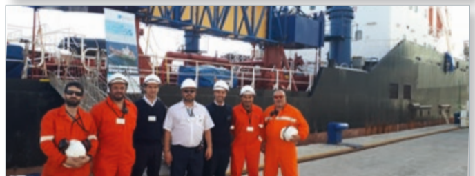
The Monte Anaga, standby oil spill pollution response vessel, was open to visitors on 19 November from the port of Malaga