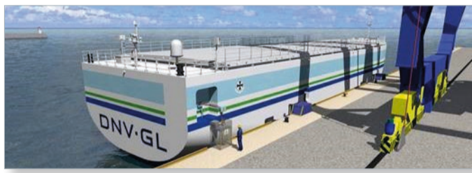
The SAFEMASS study was commissioned by EMSA in July 2019 and is being conducted by DNV GL

A workshop for sharing knowledge and exchanging information on Maritime Autonomous Surface Ships (MASS) was held at EMSA on 25 November. In attendance were representatives from both national maritime administrations and the European Commission, as well as selected researchers. All participants provided valuable contributions on the topic for which EMSA has been acting as a facilitator to both enable and promote technical discussions. In this respect, the Agency commissioned a study in July 2019 (called SAFEMASS) which focuses on identifying hazards and emerging risks in two specific degrees of autonomy as well as on suggesting appropriate risk control options. A number of interesting projects are underway and expected to provide valuable input in the years to come. The workshop agenda covered the interim results of the SAFEMASS study, other ongoing projects, and the current state of play of the ongoing Regulatory Scoping Exercise at IMO.