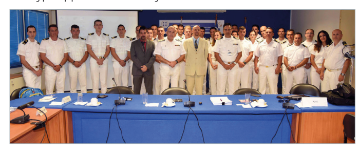
The course also included practical exercises on enforcement

In cooperation with the Hellenic Coast Guard, EMSA held a training course in Piraeus on 10-11 September on implementation and compliance in relation to the International Convention for the control and management of ballast and sediment from ships. The course was delivered by EMSA representatives and was attended by officers from central port authorities and directorates of the Hellenic Coast Guard. The topics covered included: detailed information on the BWM Convention; an update on ballast water treatment technology; the PSC view of control, monitoring and enforcement; and, sampling and type approval of BWM systems.