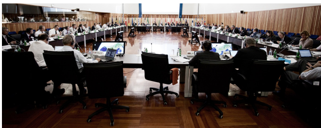
Representatives discuss plans for the upcoming years

During its first meeting of 2013, on 19-20 March, EMSA's Administrative Board discussed the preliminary 2014 Work Programme, taking account of the revised founding regulation. The Agency will continue with its programme of inspection visits and its vessel monitoring and pollution activities, which remain its core tasks. The multi-annual staff policy for 2014-2016 was also on the agenda, as well as the revision of the Agency's five-year strategy. The Board members were given an overview of the proposed scope of the revision exercise by the Chairman of the steering group appointed for this exercise and will have a more detailed discussion at the June meeting. The finalisation of the revision is planned for November 2013. Lastly, the Board was introduced to SafeMed 3, an EU-funded project starting in mid-June which will see EMSA play a key role in maritime training and safety in the Southern Mediterranean region.