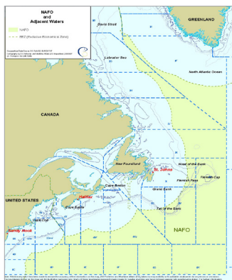
Satellite control moves away from European waters

From 1 March to 30 April, EMSA is offering assistance to the European Fisheries Control Agency (EFCA) for the coordination of its fisheries control and surveillance activities in the regulatory area of the Northwest Atlantic Fisheries Organisation. For the first time, EMSA's integrated maritime data environment is being used to monitor a large sea area with low ship density. New data streams