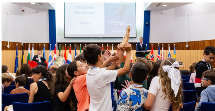
Scenes from the second edition of EMSA’s children’s art competition award ceremony