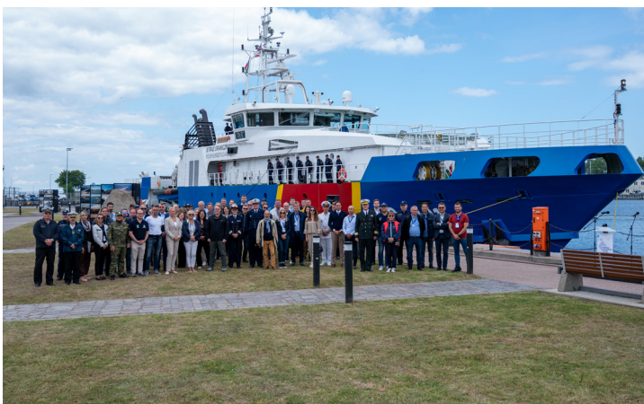
At the handover ceremony of the Chairmanship of the Tripartite Working Arrangement in Gdansk where our Executive Director received the symbolic chairmanship bell,