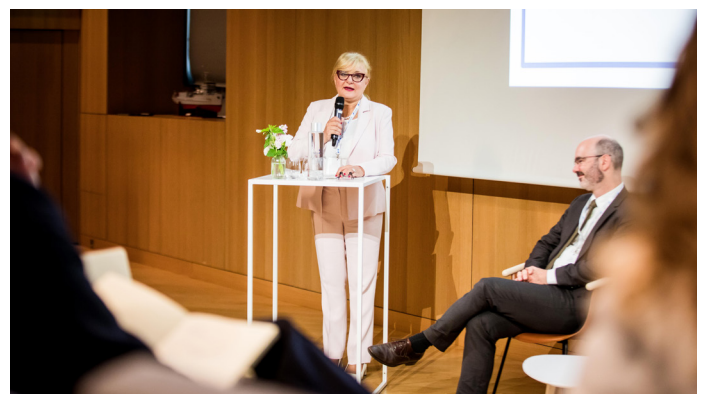
Celebrating 25 years of Equasis at a special ceremony in Paris, co-organised by the French national administration and EMSA.