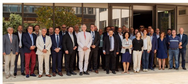
Attendees at the 15th PCF meeting, held in EMSA's Lisbon headquarters.

From 3rd to 5th June 2025 EMSA hosted the 15th meeting of the Permanent Cooperation Framework, PCF, for the Investigation of Accidents in the Maritime Transport Sector. The objective of the PCF is to provide an operational forum enabling the Member States' investigative bodies to cooperate, in line with Article 10 of Directive 2009/18/EC. 35 participants, from 22 Member States, European Commission and EMSA, discussed a range of issues including cooperation with other investigative bodies and future developments. PCF working groups presented their work and conclusions.