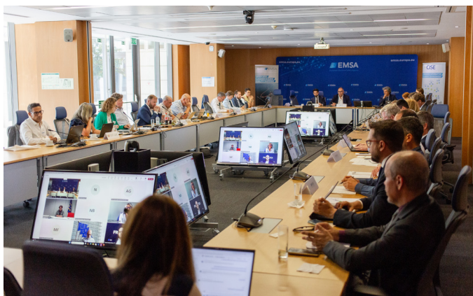
The 17th CISE stakeholder group took place at EMSA on 17 and 18 June, bringing together stakeholders from all over the EU.