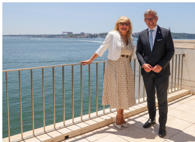
Our Executive Director and Commissioner Brunner at EMSA's headquarters during his visit on 5 June.