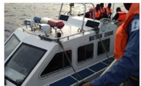
Photos of the operation