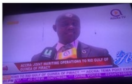
The operation was viewed positively by the national media