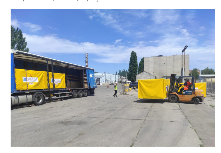
The EMSA equipment being unloaded in Odessa port, ready to enter into service.

Two sets of New Naval fence booms from EMSA's Equipment Assistance Service stockpile in Varna have been delivered to Odessa, Ukraine. The equipment, which totals 800 metres in length, has been donated to the Ukrainian Sea Ports Authority to assist in tackling potential pollution from sunk and damaged vessels in Kherson Port. All ports in Ukraine currently require equipment to combat marine pollution. The equipment is being donated to Ukraine by EMSA in the framework of the Black and Caspian Sea (BCSEA) II project.