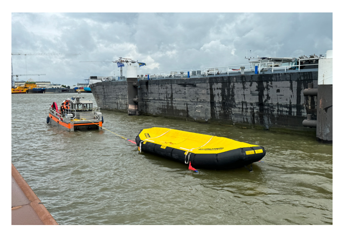
Hands-on EAS training in The Netherlands brought together equipment operators from all over the EU and EFTA

EMSA recently organised a hands-on training course in Werkendam in the Netherlands for equipment operators from EU/EFTA Member States. Over the course of three days, representatives from Belgium, Finland, France, Germany, Latvia, Sweden, and The Netherlands were trained on the use of selected oil pollution response equipment systems that are part of EMSA's Equipment Assistance Service (EAS). The EAS can top-up Member States' capacities to respond to a pollution event at sea and is part of the toolbox of pollution response services that EMSA maintains in full operational readiness.