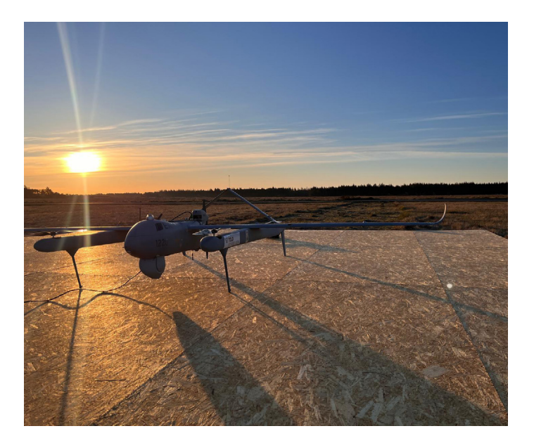
The RPAS deployed in Denmark has infrared and optical cameras and is also equipped with an embedded automatic maritime scanning sensor.