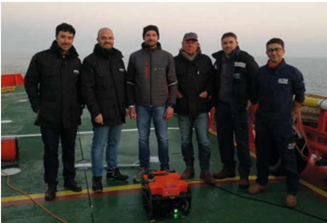
EMSA team joins Italian Accident Investigation Body (DIGIFEMA) and ACSM ROV specialists for mission in the North Adriatic Sea in February