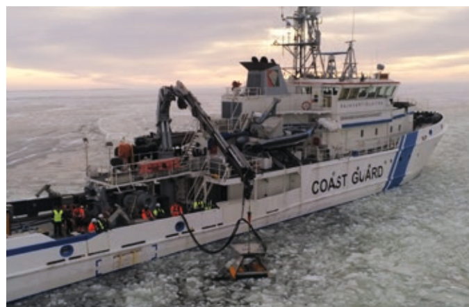
Finnish Border Guard Uisko tests out EMSA arctic skimmer LAS 125 capabilities in ice conditions

The Finnish Border Guard recently activated EMSA's offer to Member States for in-country training on the use of the Agency's oil spill response equipment. During a training event held on February 6-7, the Finnish Border Guard deployed one of EMSA's Arctic Skimmers from the Agency's Equipment Assistance Stockpile in the Northern Baltic. EMSA currently has four arctic skimmers, two LAS 125 and two LRB150, located in Tolkkienen, Finland, to cater to the specific ice conditions in this part of Europe. The skimmer was deployed by the Finnish Border Guard vessel UISKO in the Gulf of Bothnia during a joint exercise with the Swedish Coast Guard. This training opportunity highlights the importance of being prepared for potential oil spill incidents and the benefits of collaborating with other agencies to ensure effective response measures. EMSA's Equipment Assistance Stockpile provides Member States with access to specialised equipment to enhance their oil spill response capabilities.