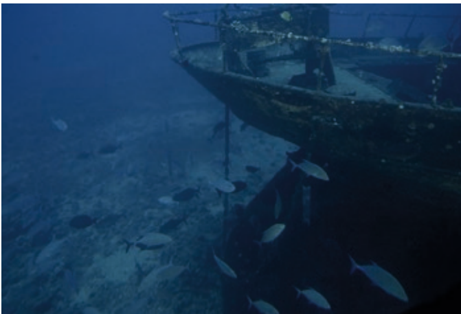
ROV help bring greater clarity to underwater accident investigation

EMSA has introduced a new operational service aimed at supporting Accident Investigation Bodies (AIB) in collecting crucial evidence from sunken ships to aid in understanding accidents and preventing similar incidents in the future. The service, which uses observation-class Remotely Operated Vehicles (OC/ROV), provides underwater surveys and is specifically designed to meet the challenging needs of AIB. This rapidly deployable and flexible service has been developed in close cooperation with the Permanent Cooperation Framework for accident investigation, the EU network of AIB. ROV services are provided to AIB on a voluntary basis, on-demand and free of charge. Although the service is designed to meet AIB needs, it is also offered to the national authorities in the context of Coast Guard functions, for instance for marine safety and counter-pollution operations. In February 2023, the Agency successfully conducted its first two missions deploying ROV in the North Adriatic Sea and the Gulf of Biscay to gather evidence from two sunken vessels, under the coordination of the competent Accident Investigation Bodies, showing the service's capabilities to deliver the expected results.