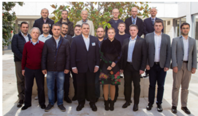
22-26/1/2018 – Participants in the Seminar for BS MoU Port State Control Officers in EMSA, Lisbon, Portugal

Furthermore, two Tutoring Projects on Port State Control were held in Turkmenistan and Kazakhstan.