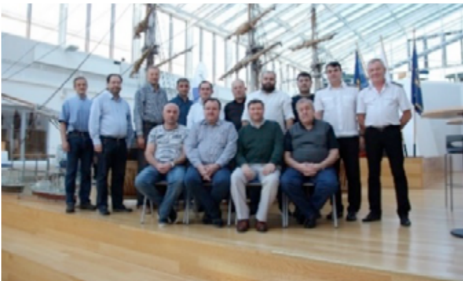
27/8-5/9/2018 - Participants in the Training for Vessel Traffic System Operators in Turku, Finland

To support the sharing, beneficiaries participating to the relevant pilot project have been offered the opportunity to apply to the Call for Expression of Interest (CEI) launched by the Agency for donation of AIS stations and Central Nodes. The donation is in the final phase and it will be concluded during the first quarter of 2019.