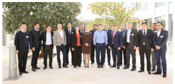
20-21/11/2017 – Participants in the Training on MARPOL Annex VI, Prevention of Air Pollution from Ships, in EMSA, Lisbon, Portugal

Azerbaijan, Georgia and Ukraine are provided with CleanSeaNet services and SAT-AIS information to support the early detection of oil spills in the waters under their jurisdiction to facilitate the identification of possible polluters. Beneficiary countries were also trained in the use of the new SafeSeaNet Graphic User Interface (SEG), the common web interface providing access to EMSA's maritime applications.