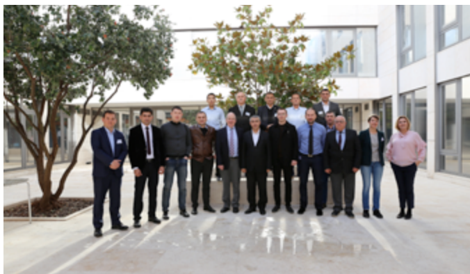
10-14/12/2018 – Participants in the Core Skill course on Accident Investigation in EMSA, Lisbon, Portugal

Beneficiaries were also supported in the task of monitoring the Recognised Organisations delegated to carry out surveys and issuing statutory certificates on their behalf. They were also supported to prepare for the IMO Member State Audit Scheme (IMSAS).