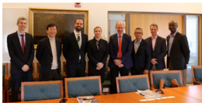
12-13/9/2018 – Participants in the 2nd Steering Committee at the Maritime Transport Agency of Georgia in Batumi, Georgia

Various communication actions have been implemented: the project's page on the EMSA website has been revamped and constantly updated. The project has also been presented to international for a and participated in high-level activities such as the EU-ISRAEL Multimodal Transport Dialogue and the visit to the World Maritime University.