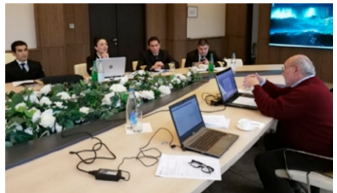
6-8/2/2018 – Provision of support to the State Maritime Administration of Azerbaijan (SMAA) to develop a professional development scheme for Flag and Port State inspectors at SMAA premises in Baku, Azerbaijan

10-13/12/2018 – Turkmenistan : Preparatory audit in view of the IMO Member State Audit Scheme (IMSAS)