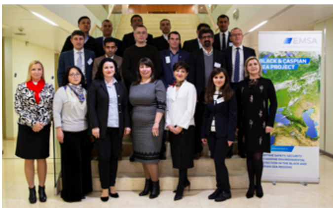
30-31/1/2019 – Participants in the Training on the Implementation of Maritime Labour Convention in EMSA, Lisbon, Portugal

30-31/01/2019 – Training on implementation of MLC, 2006