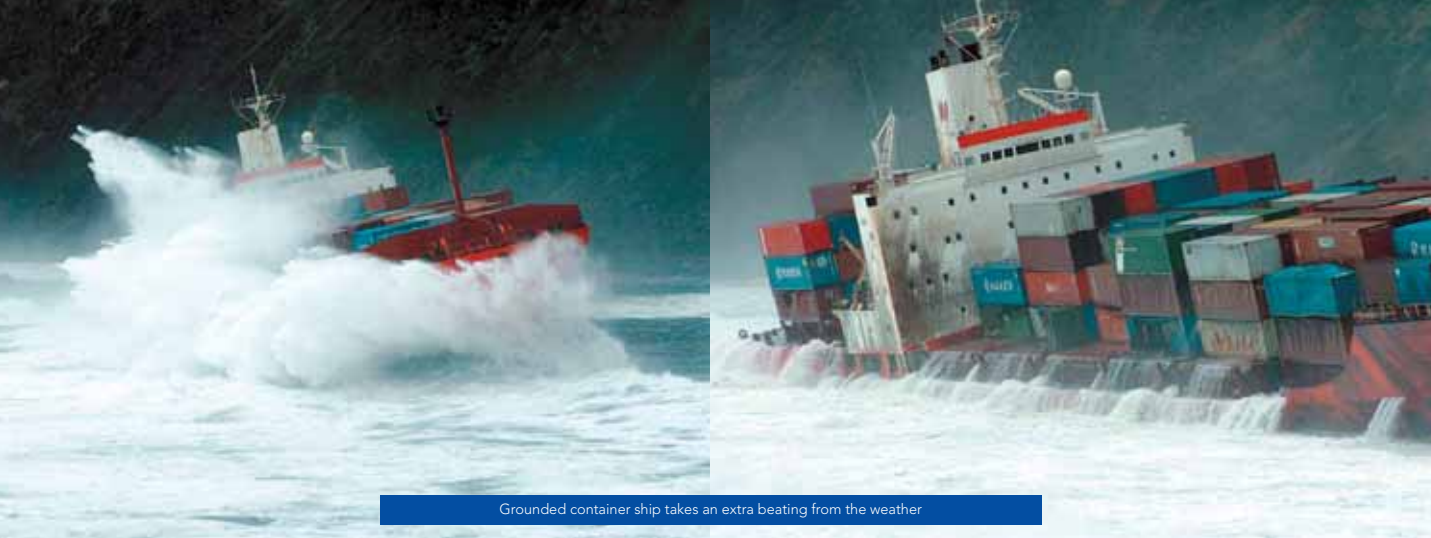
Grounded container ship takes an extra beating from the weather