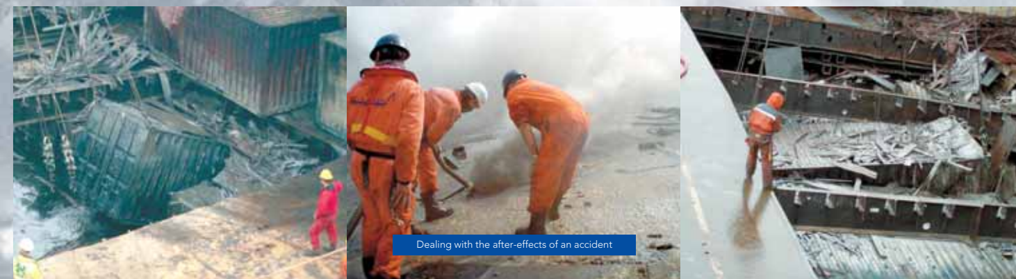
Dealing with the after-effects of an accident

It is essential that those who carry out accident investigations throughout the European Union undertake their work in a consistent and effective way. This ensures that high quality investigations are carried out with the aim of establishing the causes and circumstances, so that effective recommendations are developed to improve maritime safety, prevent pollution and reduce the risk of casualties. In cooperation with the Commission and Member States, EMSA is developing an investigation methodology, and is also promoting the introduction of guidelines for accident investigators which are based on best practice throughout the EU. Within this framework, it is also developing ways of training investigators. With respect to the development of guidelines, these are intended to provide investigative bodies, and their investigators, with guidance on the practical implementation of the main principles of accident investigations, as detailed within the methodology. The guidelines are based on best practice, and take into account experience within the sphere of maritime safety investigation, as well as in other sectors. Updated versions will be produced in response to expert advice as developments occur within the sphere of safety investigations and within the maritime industry.