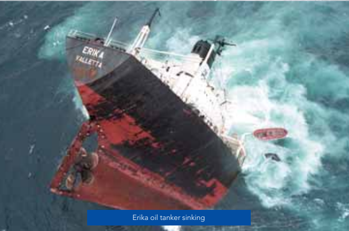
Erika oil tanker sinking

Shipping is not only the backbone of the global economy, but it is also a significant growth sector, in particular because of the need to transport larger volumes of commodities and manufactured goods to the places where they are needed. The requirement to transport such volumes of goods, as well as large numbers of passengers, at competitive prices on board ships involves a certain