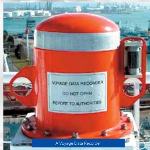
A Voyage Data Recorder

Looking to the longer term future, EMSA also participates in projects which will enable it to keep at the forefront of technical developments, and therefore enable it to move forward quickly and to recommend appropriate actions to other Member State accident investigation interests.