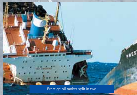
Prestige oil tanker split in two

The lessons learned from maritime disasters and lesser accidents have had a major impact on improvements in maritime safety over the years, but there are still many things to be done to improve the situation in the EU. At the present time, although there is extensive work done throughout the Community on the investigation of accidents, there are often significant differences in the ways in which the work is carried out. In some cases, investigations are carried out systematically, while in others, the approaches taken can be relatively non-systematic and often superficial. Also, many Member States do not have