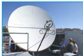
The new equipment being installed at EMSA's new headquarters

Tourists admiring the Tagus River from the Lisbon 'miradouros' (belvederes) can now see a large white dish installed on EMSA's roof. The 3.8 metre wide antenna is part