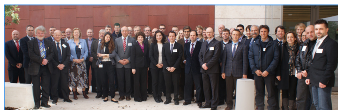
Fifty participants attended the Third Joint Workshop on Coordinated at-Sea and Shoreline Pollution Response

The '3rd Joint Workshop on Coordinated at-Sea and Shoreline Pollution Response', co-organised by EMSA and the European Commission (DG ECHO), was held on 12-13 February. The workshop was well attended with 50 participants from marine pollution, shoreline pollution and civil protection authorities from the EU, EEA/EFTA states, EU Candidate Countries and the Regional Agreements, as well as relevant industry representatives. The workshop's first day addressed the topic of health and safety during pollution response operations, while the discussions on the second day focused on national training standards for responders and volunteers and the international exchange of experts during major pollution incidents. Best practices, gaps and proposed ways forward were identified through interactive discussion groups, enabling the exchange of experience and expertise among the different authorities.