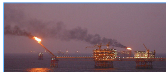
Marine pollution from oil and gas installations now part of EMSA's remit

The long-awaited amendments to the founding regulation were published in the Official Journal of the European Union on 9 February 2013 and have now entered into force. Regulation (EU) No 100/2013 finetunes EMSA's tasks and clarifies some governance issues. The amended regulation specifies the role of the Agency in assisting the Commission and in facilitating cooperation between the Commission and Member States, and its work with Member States.