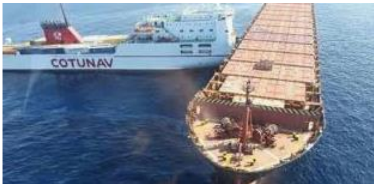
Figure 9 - Collision CSL Virginia - Ulysse on 7 October 2018, off cap Corse