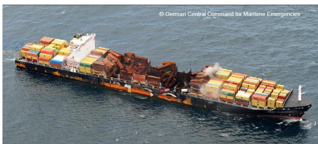
Figure 8 - Fire and explosion on board the MSC Flaminia on 14/07/2012 in the Atlantic Ocean

The alarm indicated smoke in cargo hold 4. The lookout sent from the bridge to the cargo hold confirmed there was fire in the hatch. CO 2 was discharged into the affected cargo hold to fight the fire. The area around cargo hold 4 was to be cooled down later. A team of seven crew members was working in this area to make the necessary preparations when a heavy explosion occurred. This was accompanied by the rapid development of the fire and the ship's command decided to abandon the vessel due to the overall circumstances. The occurrences resulted in three fatalities, two severely injured crew members, structural and cargo damage due to fire. The flag State, Germany, took responsibility for granting a place of refuge on 15 August 2012.