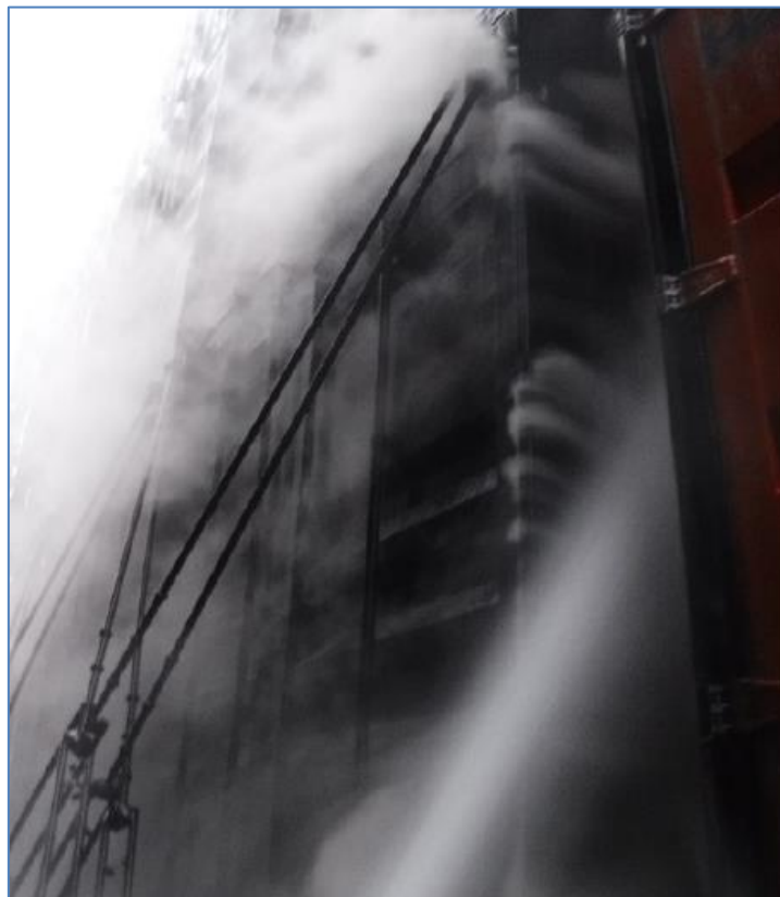
Figure 5 - Firefighting at bay 12, row 3 - Yantian Express

Since a further deterioration in the weather was predicted, the shipping company decided that all crew members should abandon the Yantian Express . Operating systems were left running wherever possible because a return was planned. The burning ship was abandoned in the afternoon of 6 January 2019.