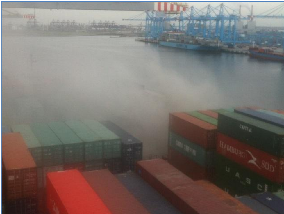
Figure 2 – Smoke from cargo hold nr.2 of MV Barzan on 07/09/2015

This chapter presents the safety issues with a potential horizontal impact on containerships.