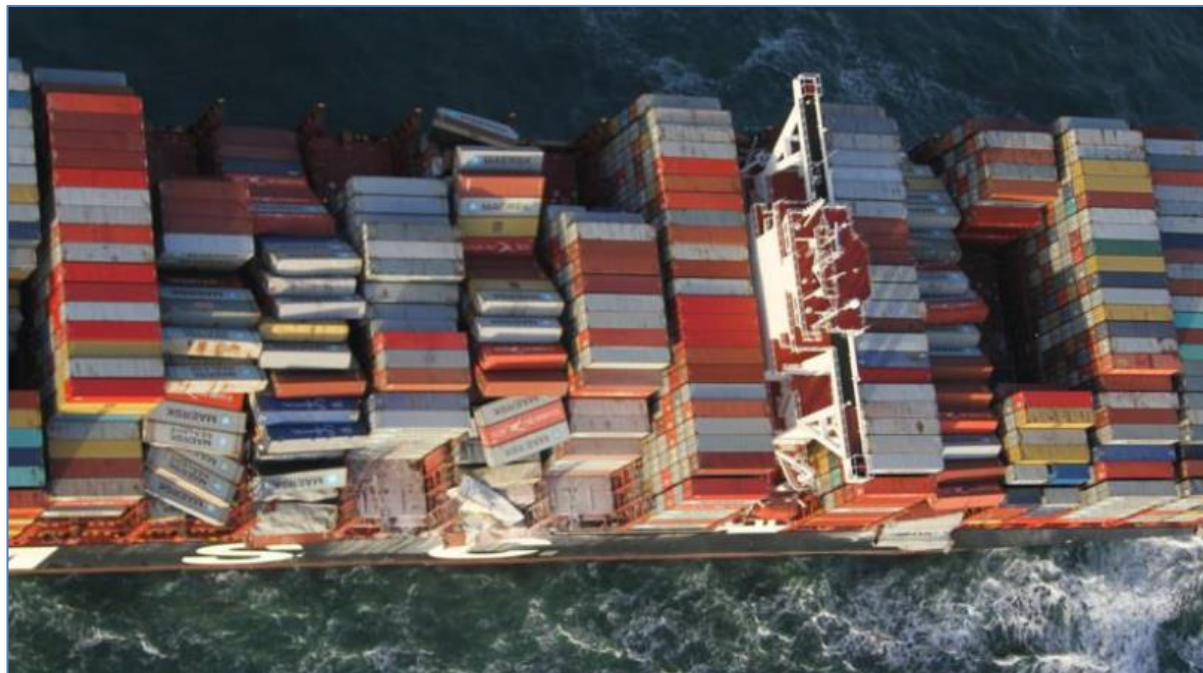
Figure 1 - Top view MSC Zoe following the loss overboard of containers