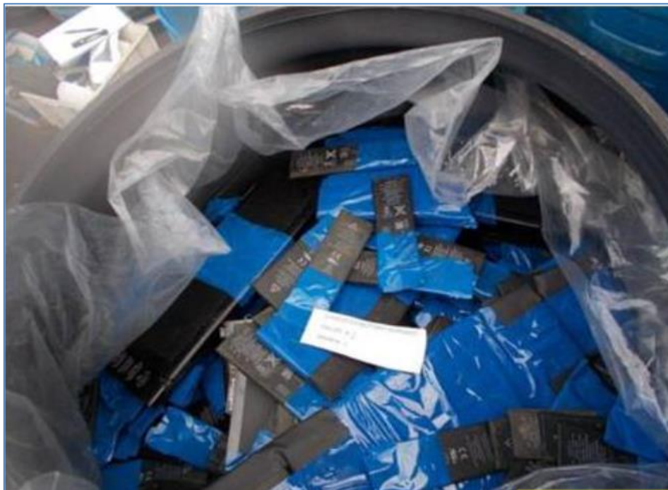
Figure 4 – Example of used lithium-ion batteries cargo loading

On 15 June 2016 CMA CGM Rossini was loading cargo at Colombo (Sri Lanka) when two sailors in charge of lashing securely containers detected a burning smell when they arrived at bay 30 starboard. An explosion occurred coming from the containers loaded in bay 34, in the hold 5 starboard. The officer of the watch was immediately informed and the firefighting procedure enforced. Less than 30 minutes later, a harbour firefighter team arrived on board and the firefighting strategy implemented by the crew was carried on. The source of the fire was one of two 40-foot containers, loaded at Sydney and destined for Antwerp. One of these contained 26 pallets of 104 drums loaded with lithium-ion batteries, which net weigh was 16.692 metric tons.