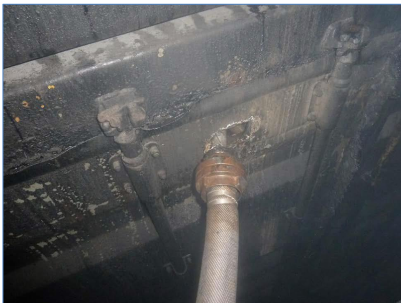
Figure 3 - Burning container on board of Caroline Mærsk with spike nozzle inserted

In the afternoon of 26 August 2015, a fire broke out in a container in a cargo hold on board the container ship Caroline Mærsk. At the time of the accident, the ship was positioned approximately 50 nm from the coast of Vietnam. The fire broke out as a result of charcoal self-igniting in a cargo container below deck. According to the cargo manifest, the contents were described as 'tablet for water pipe'. The IMDG Code states that charcoal is a Class 4.2 cargo, which covers substances liable to spontaneous combustion; however, the cargo of the burning containers had not been declared as dangerous cargo. These facts indicate that the container contents should have been declared as dangerous cargo from the shipper's side, but they were not.