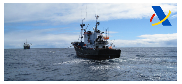
Offshore patrol vessel Petrel I towing the Venezuelan flagged fishing vessel