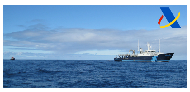
Offshore patrol vessel Petrel I towing the Venezuelan flagged fishing vessel