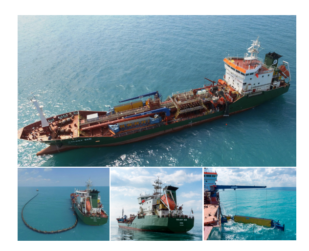
Slick detection system