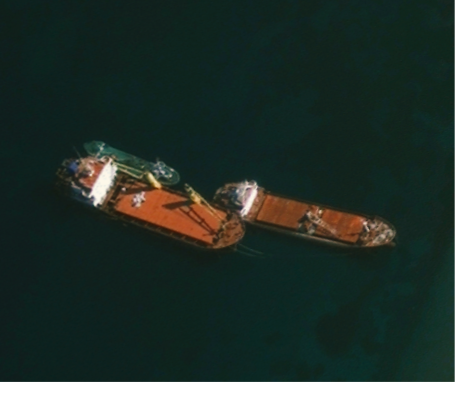
Emergency response benefits from EO data