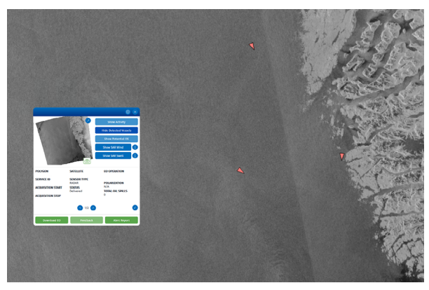
Locating and identifying non-reporting vessels is a key component of maritime security operations