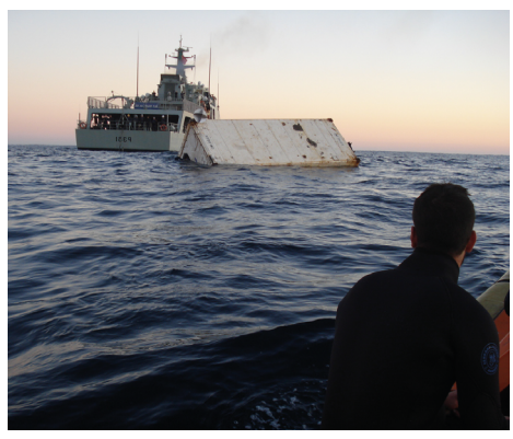
Floating objects pose a risk to navigation