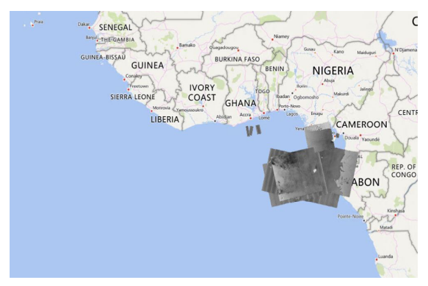
CMS provides support to international organisations in accordance and with the approval of DG-GROW and EEAS