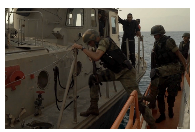
High resolution imagery provide detailed information for intelligence-led operations