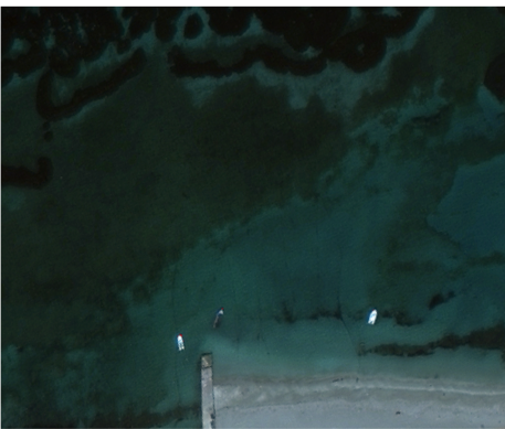
CMS monitors shoreline activities