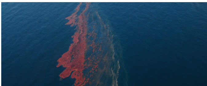
Aerial view of oil spill