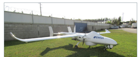
Marine Pollution Monitoring & Maritime Surveillance