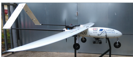
Maritime Surveillance & Emissions Monitoring

RPAS can undertake a wide range of missions. EMSA has different RPAS types and payload configuration in its portfolio to be able to cover the different user needs. Depending on the mission, RPAS fly close to shore, i.e. within Radio Line of Sight (RLOS) or further offshore, i.e. Beyond Radio Line of Sight (BRLOS) using satellite communication. All aircraft control communications are via a Local Ground Station. The RPAS with their payload configuration are multi-purpose in nature, e.g. it is also suitable for other vessel monitoring and detection activities.