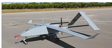
Maritime Surveillance & Emissions Monitoring