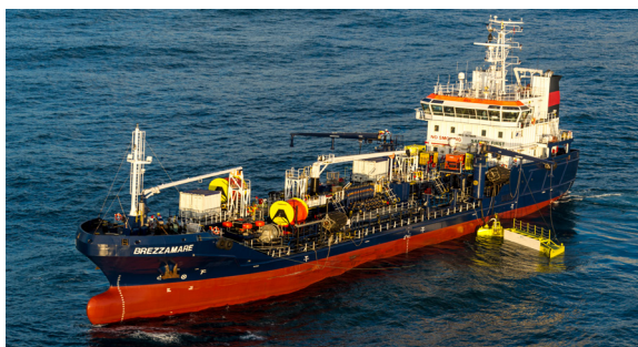
Slick detection system