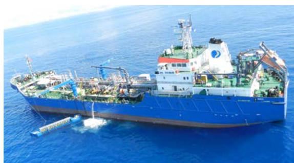
Slick detection system