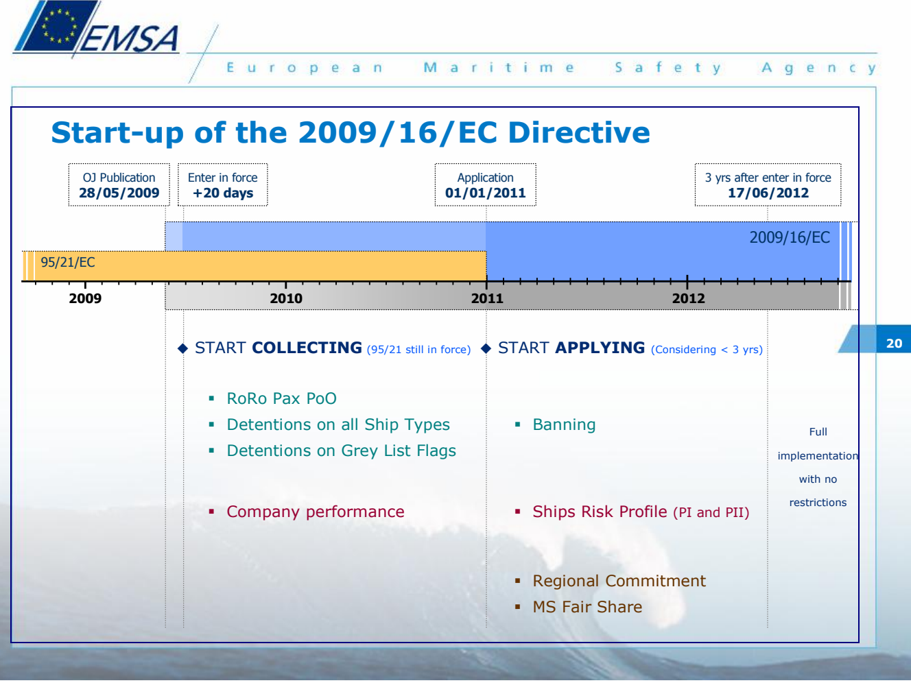
Image: The collection of information for the NIR began in June 2009, while application of the rules begins in January 2011.

Although, the Directive's transposition period expires on 1 January 2011, it is important to note that the Directive officially entered into force on 17 June 2009. Therefore, application of the new Directive's