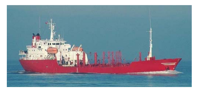
Location of EMSA contracted oil pollution response vessels.