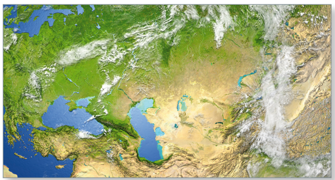
The Black and Caspian Sea project started on 1 February 2017 and runs for 48 months

Within the framework of the SAFEMED IV Project and the Black and Caspian Sea Project, EMSA hosted in April the first meeting of the Secretariat of the Mediterranean Coast Guard Functions Forum (MCGFF) as well as a coordination meeting with the Black Sea MoU Secretariat. The MCGFF meeting was attended by the Turkish Coast Guard, the Italian Coast Guard and the French Sea Administration, as current, past and future chairs of the forum. The event is designed to enhance cooperation between FU and non-EU Mediterranean countries as well as to reduce the gap in the implementation of international maritime conventions. EMSA, EFCA and FRONTEX, the three agencies cooperating on Coast Guard Functions, attended the meeting as observers. The meeting concluded with a road map and list of actions to be taken in view of the plenary session expected in October in Turkey. The coordination meeting between EMSA and the BS MoU Secretariat covered the activities already delivered by the agency under TRACECA II as well as future activities to support the PSC authorities of non-EU members of the BS MoU. The main outcome of the meeting was the agreed proposal for EMSA to implement a professional development scheme for PSCOs.