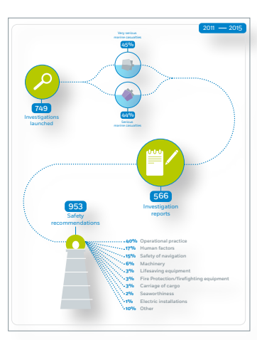
953 safety recommendations were issued as a result of the 584 investigations conducted, the reports of which are available on the EMCIP portal

EMSA has recently published the first Summary Overview of Marine Casualties and Incidents. The Overview presents key accident and incident data for the years 2011-2015, as reported to the European Marine Casualty Information Platform