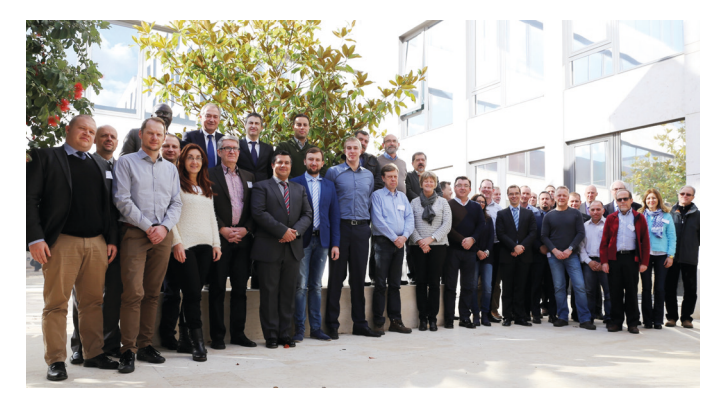
EU authorities are responsible for carrying out inspections, sampling and analysing the marine fuels used on board ships while in their ports.

On 4-5 February, EMSA organised its first ever training seminar on the enforcement of Directive 1999/32/EC (as amended) on the sulphur content of marine fuels. Participants were drawn from those member state authorities responsible for the enforcement of the directive and, in particular, ship inspections. The training focused mainly on the requirements of the directive, the inspection process on board ships, with or without abatement methods, documentary verification, the sampling process and the use of THETIS-S (both pre and post-boarding). This seminar follows other efforts which have been made by EMSA to support the European Commission and the member states in the implementation and enforcement of the Sulphur Directive. EMSA has been closely involved in all relevant subgroups of the European Sustainable Shipping Forum (ESSF) since its outset.