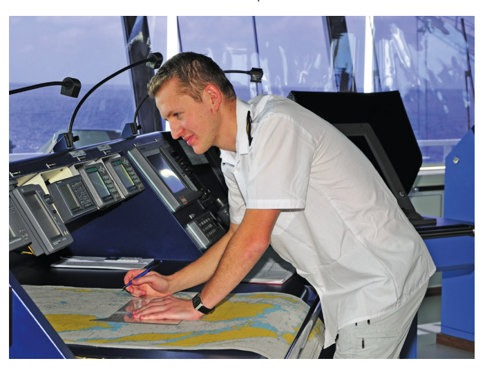
EMSA can now compile annual statistics on the number of EU and non-EU seafarers entitled to work on board EU flagged ships

The New Year saw a further phase in the development of EMSA's STCW Information System, with data now being received on certificates and endorsements issued to seafarers by EU maritime administrations. Directive 2008/106/EC (as amended) on the minimum level of training of seafarers provides for the collection and analysis of data which will allow EMSA to compile annual statistics on the number of EU and non-EU seafarers entitled to serve on board EU flagged ships. This will benefit member states, maritime administrations, policy makers, and the shipping industry in general. At a time when organisations are finding it difficult to identify qualified people to work on board ships, the system is once again showing considerable added value with this latest development.