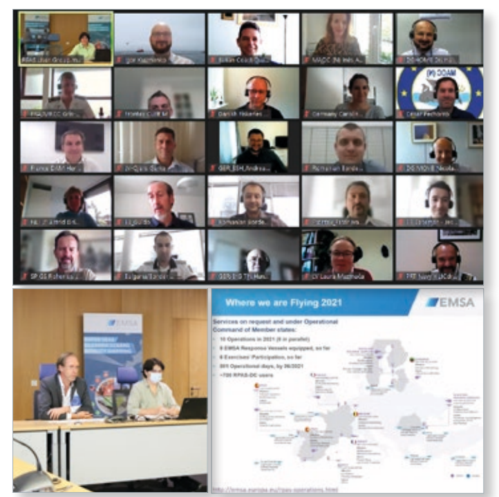
The RPAS user group gave participants the opportunity to explore in more depth possibilities for regional cooperation

The 4<sup>th</sup> RPAS User Group meeting took place virtually over two half days on 30 September and 1 October. The purpose of the meeting was to enable participants to share how the RPAS services have contributed to their operational activities; to learn more about past, current and upcoming EMSA RPAS operations; and to gather lessons learnt from experience with the service to date. There were a number of interesting presentations from users of the service, ranging from emissions monitoring, to maritime surveillance, to port monitoring, and covering both single and multi-purpose operations. In addition, breakout groups on both days allowed participants to explore in more depth the topic of regional cooperation and to reflect on lessons learnt. The User Group meeting was attended by more than 60 participants, including representatives from member states, EU Agencies, and the European Commission.