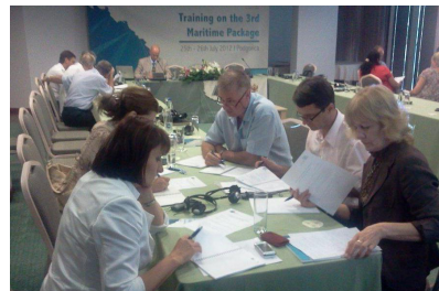
Some 25 staff from the ministry of transport, central and local maritime and port authorities all attended the course

A two-day training course was held by EMSA in Montenegro as part of a project financed by the European Commission's Directorate General for Enlargement. The project is geared