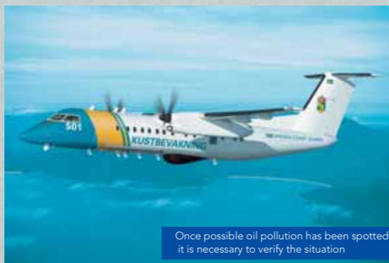
Once possible oil pollution has been spotted by satellite, it is necessary to verify the situation

Directive 2005/35/EC on ship sourced pollution, and on the introduction of penalties for infringements, tasks EMSA with working with Member States to develop technical solutions and to provide technical assistance in relation to the implementation of the Directive. In line with this, the Agency provides a European operational system for oil slick detection based on satellite sourced synthetic aperture radar (SAR) images. The service is aimed at supporting the response chain of Member States for locating polluters, and is offered to authorities in all EU and EFTA states. It became operational in April 2007 and is under continuous development.