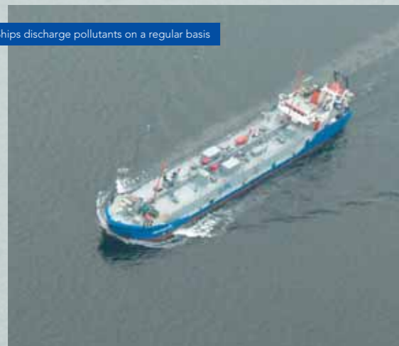
Ships discharge pollutants on a regular basis

Although the shipping industry has a substantial number of very responsible ship owners and operators, some are motivated to deliberately pollute the sea for several reasons. Firstly, it is a lot cheaper to dump waste at sea than to collect it in the approved way and then to deposit it in onshore facilities. Secondly, it is a lot easier and quicker to dump than to expend the time and effort needed for disposal at approved processing sites. Thirdly, owners and operators often argue that shore based waste reception facilities are not readily available. Consequently, if unscrupulous operators believe that they are unlikely to be spotted, or if they believe that the consequences of being caught are not significant enough to deter them, they will continue with their illegal discharges. However, should the likelihood of being spotted increase, this could substantially reduce such illegal activities.