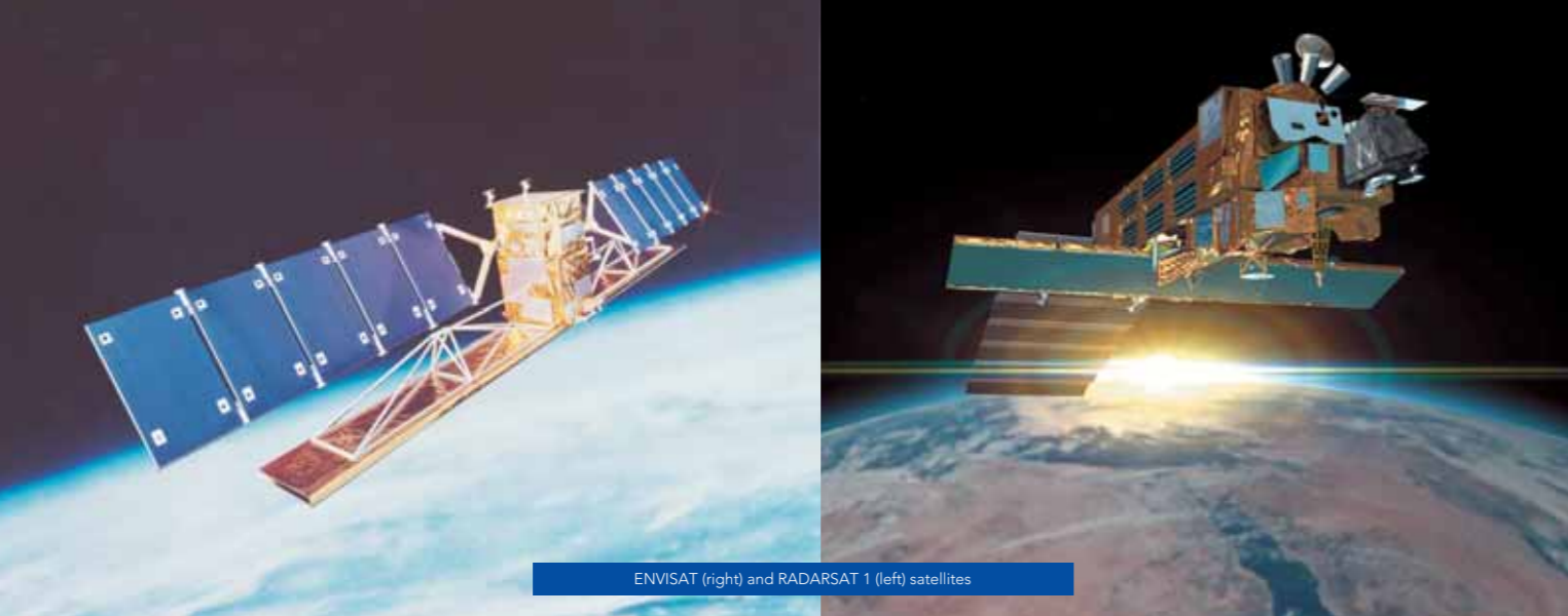
ENVISAT (right) and RADARSAT 1 (left) satellites