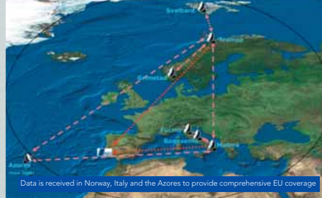
Data is received in Norway, Italy and the Azores to provide comprehensive EU coverage

In the recent past, a total of around 1400 satellite images per year were used and ordered individually by twelve EU countries. These are purchased from satellite operators or service providers under national contracts or are provided by the European Space Agency led MarCoast project. However, some countries have stated that the current number of images used is not enough to satisfy their real needs and that they wish to monitor their sea areas more extensively. The EMSA task is to provide a baseline service throughout EU waters which Member States can 'top up' according to their requirements. The intention is that, once they have received information on potential polluters, Member States send out aircraft or vessels, when appropriate, to verify the existence of pollution and provide an appropriate follow-up, including the tracking of the polluter. EMSA should then be informed of the results.